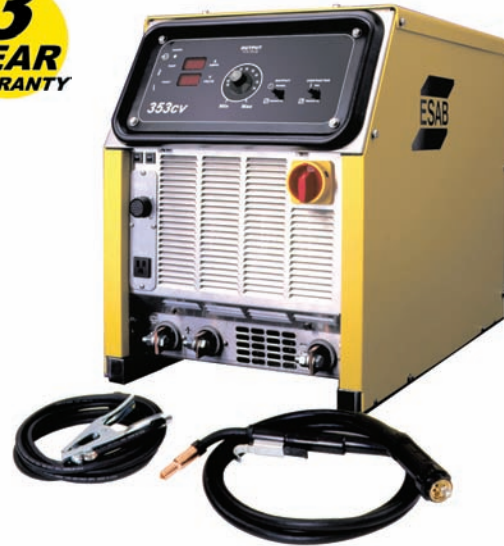
Composite Plastic Panels