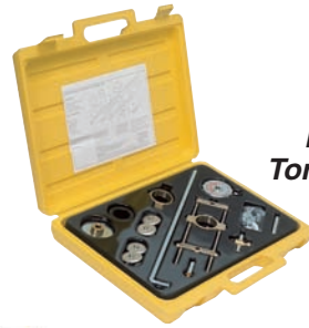
Deluxe Torch Guide Kit