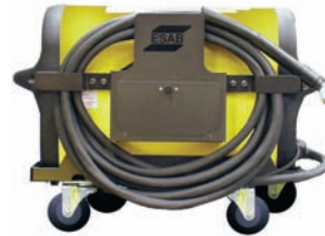
Torch Wrap and Kit Holder PowerCut® Machines