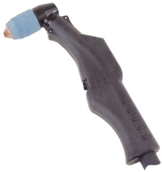
PT-32EH CUTTING SPEEDS OUTPUT CURRENT 40AMPS w/AIR @ 75psi (5.2bar)

Torches and torch body assemblies are supplied without electrode, nozzle, heat shield and valve pin. Order individual components shown with PT-32EH parts breakdown on next page.